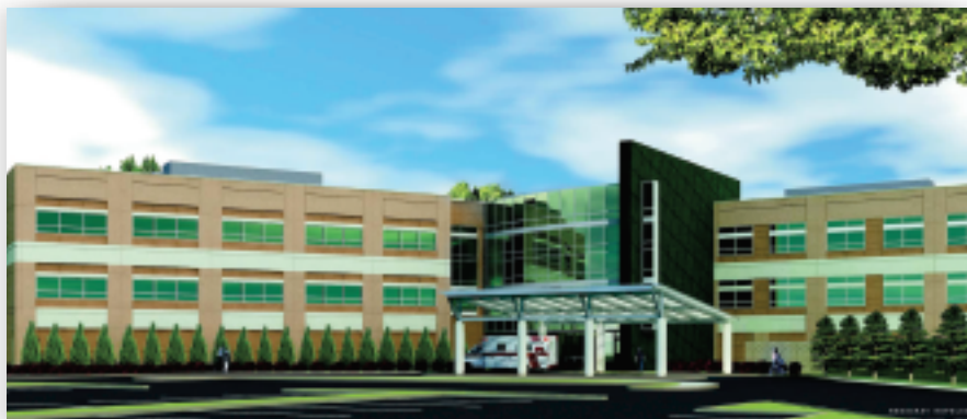
Kessler's new, 100,000-square-foot West Orange facility will bring four renowned rehabilitation programs under one roof, creating synergies to improve patient care.

will be part of dedicated units for stroke, amputee and general rehabilitation patients. Common areas will allow for patient and family training, including the opportunity for families to stay overnight to ease patients' transition to home.