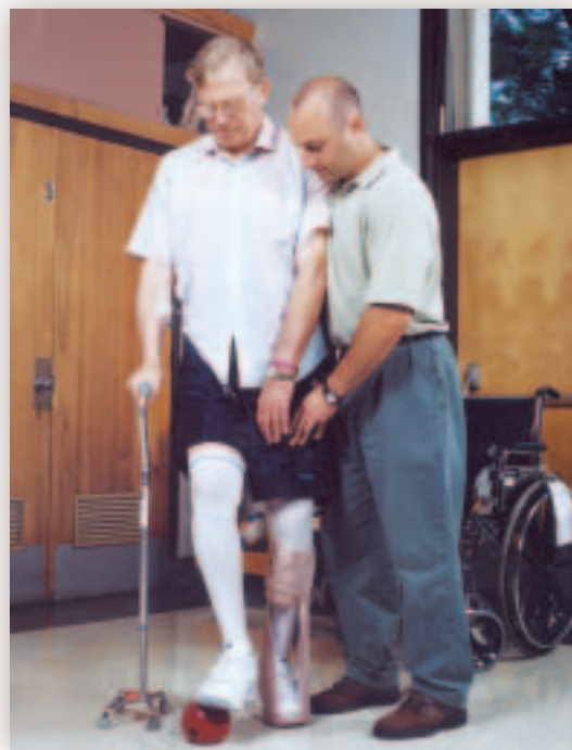
For an elderly person with an illness or injury that compromises independence, a program of inpatient rehabilitation often can make a dramatic difference.

In a specialized program, older patients also have the benefit of being with others their own age, particularly during recreational therapy